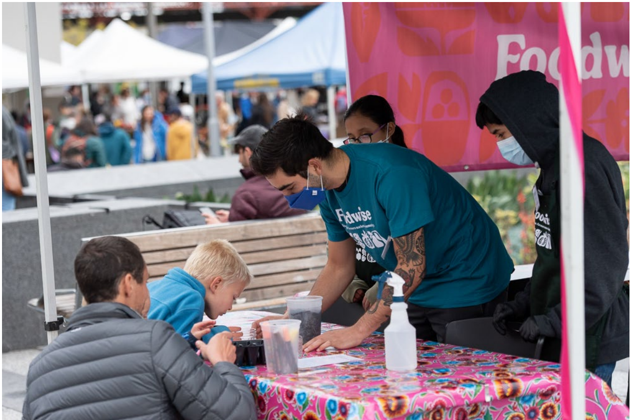
The Foodwise volunteers and students in our Foodwise Teens program host seed planting activity for families visiting the Ferry Plaza Farmers Market.