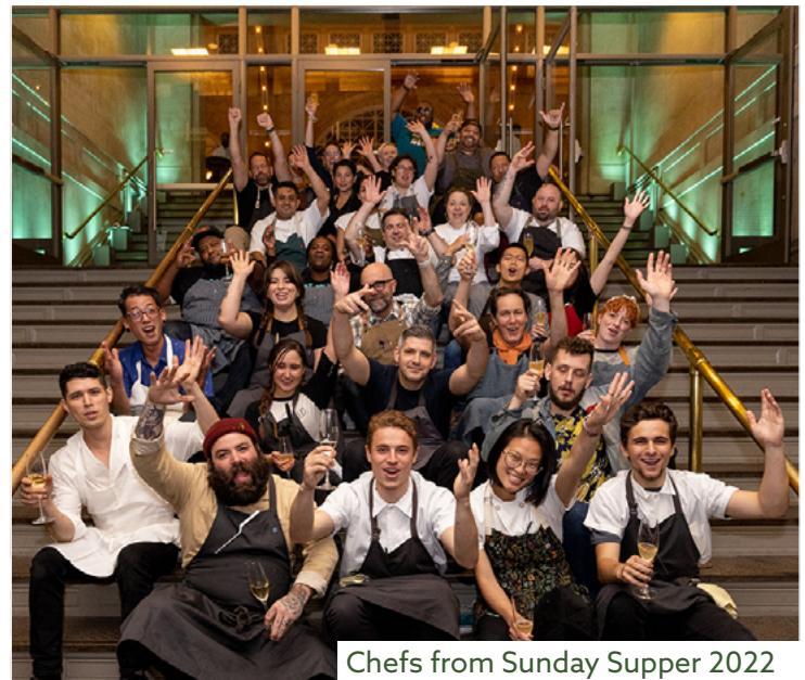
Chefs from Sunday Supper 2022